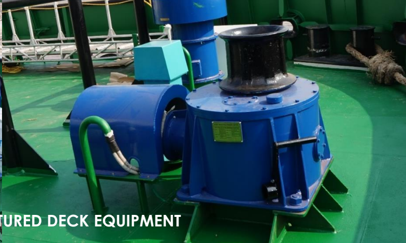
IN HOUSE MANUFACTURED DECK EQUIPMENT