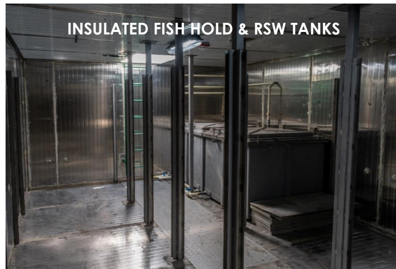
INSULATED FISH HOLD & RSW TANKS