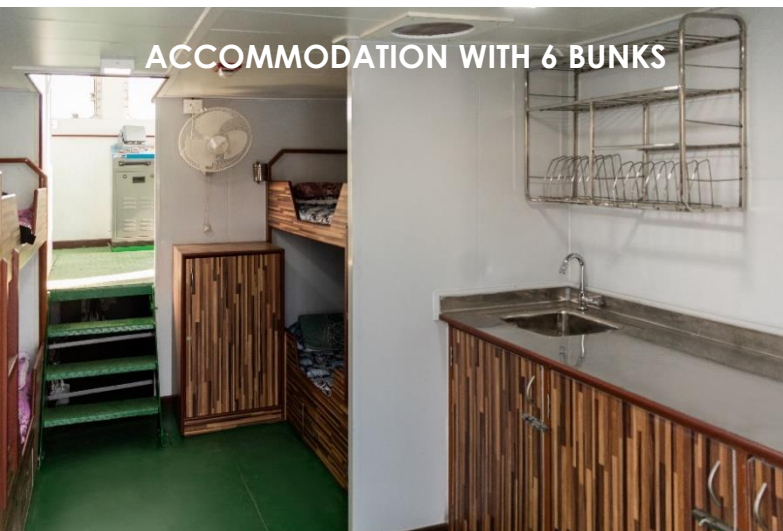
ACCOMMODATION WITH 6 BUNKS